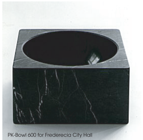
PK-Bowl 600 for Fredericia City Hall

Kjærholm was uncompromising in his insistence on structural clarity and technical quality. However, his personal concern for everyday use did much to popularize the austere functionalist style with which he is associated.